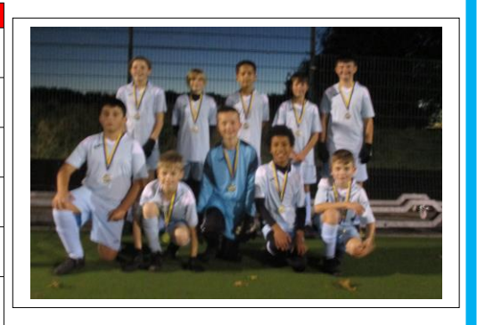
Final Trowbridge District Football League Table 2021 (Large Schools)