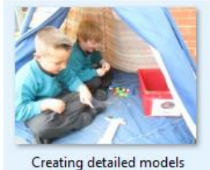
Creating detailed models