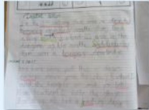
Writing outcomes - Castles - a long long time ago