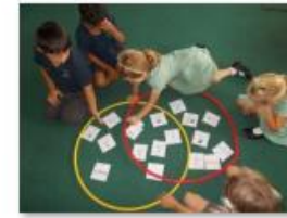
A display of our learning