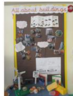
A display of our learning