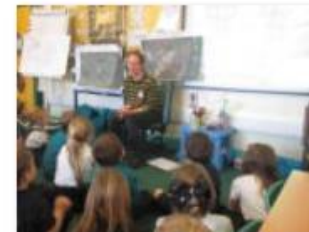
Our special visitor from the local planning office