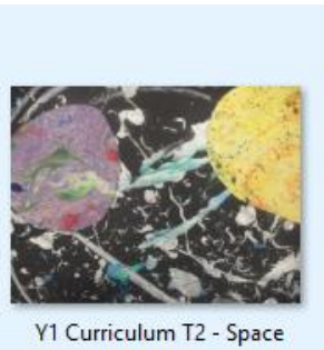
Y1 Curriculum T2 - Space