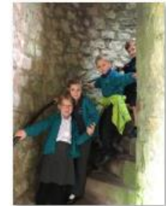
Our trip to Chepstow Castle