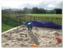
Fun exploring new sand area