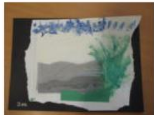
Amazing Artwork - a view from a window based on the picture book Windows by Jeannie Baker