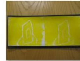
Amazing artwork - space design using a printing technique