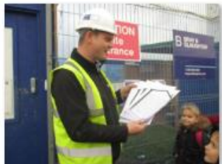
Our trip to Castle Mead School to meet the Site Officer