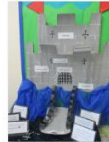
A display of our learning