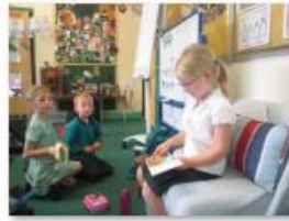
Snack time reading