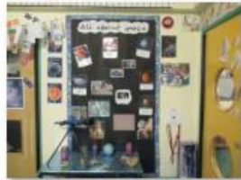
A display of our learning