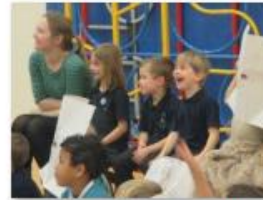
Our special visitor from the theatre company to perform The Boy Who Ate Picasso