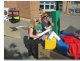
Our Animal Enrichment Day