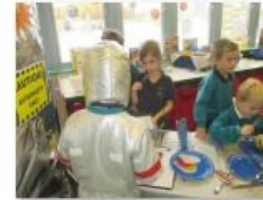
Fun exploring unusual food in the space cafe