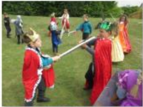
Fun on our history enrichment day