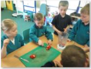
Our enrichment day - Making smoothies following a recipe