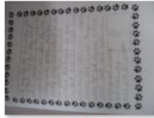
Writing outcomes - Food glorious food- innovated story based on the text The Tiger who Came to Tea