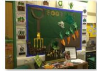
A display of our learning