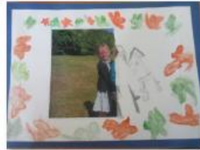
Amazing artwork - inspired by the painting childhood games