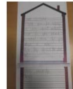
Writing outcomes - letter to the local builder at Castle Mead School