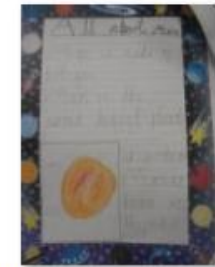
Writing outcomes - creating a class book