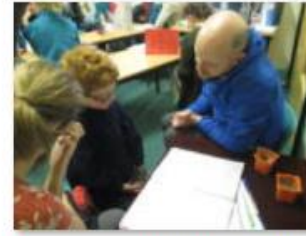
Fun sharing published stories with our parents