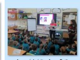
A special visitor from Bath University