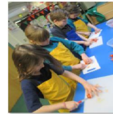
Enrichment Cooking for Parents