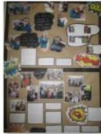
What makes a Superhero display - 1