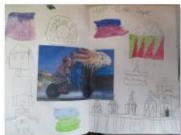
Amazing artwork - Robots