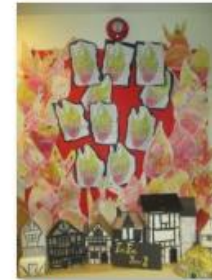
A display of our learning - Fire Fire