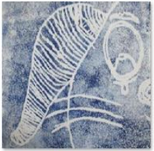
Amazing Artwork Magical Journeys