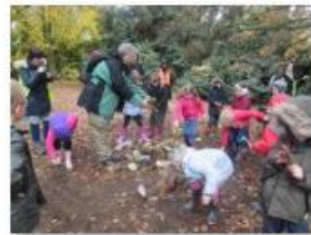
Fun on an adventure through the forest