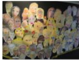
Superhero portraits - 2b