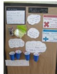
A display of our learning