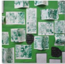
A display of our learning in Frogs