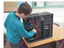
Our special visitor from Year Six