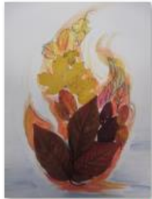
Y2 Curriculum T2 - Fire Fire