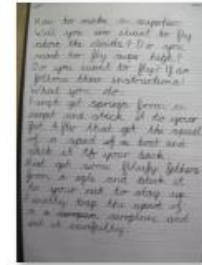
Superhero ingredients - 3