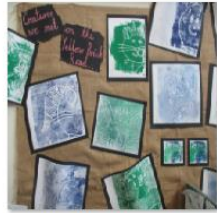
A display of our learning in Ravens