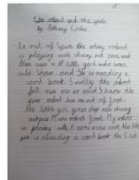
Writing outcome - Robot story