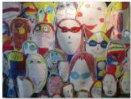
What makes a hero - 2a