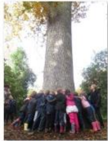
Our trip to Westonbirt Arboretum