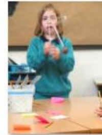
What material does sound travel through the best - 5