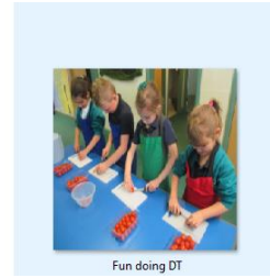
Fun doing DT