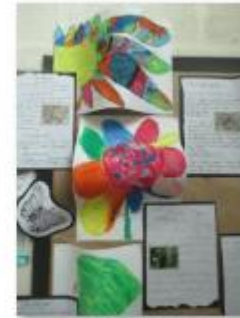
A display of our learning