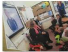
Wiltshire Air Ambulance on Superhero day 4