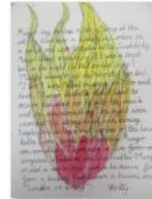
Writing outcomes - Fire Fire