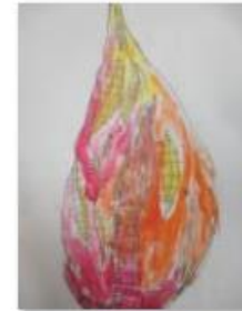
Amazing artwork - Fire Fire