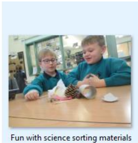
Fun with science sorting materials