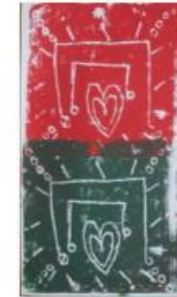
Amazing artwork - printed hieroglyph