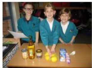
Fun cooking for our world buffet