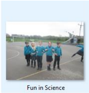
Fun in Science