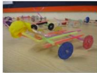
Fun building DTbuggies