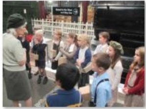
Our trip to Swindon Steam Museum