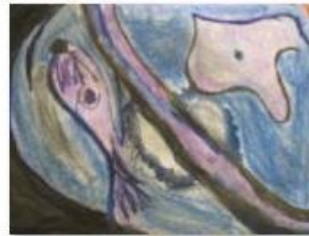
Y4 T2 - how could we survive Mars