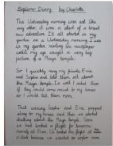
Writing outcomes - jungle explorer diary