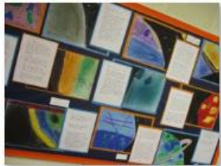
A display of our learning