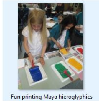
Fun printing Maya hieroglyphics