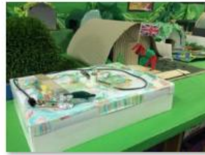
Fun building morse code machine