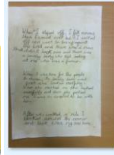
Writing outcomes - WW2 - 2