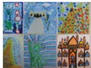
Amazing artwork of our travels