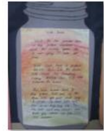
Writing outcomes- BFG