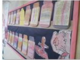
A display of our learning