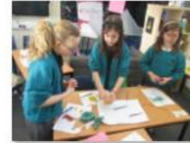
Amazing artwork- BFG