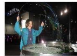
Our trip to @ Bristol