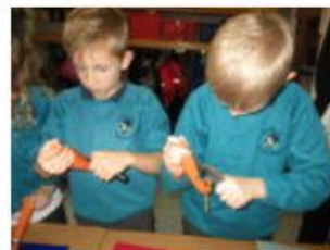
Fun with food preparation skills