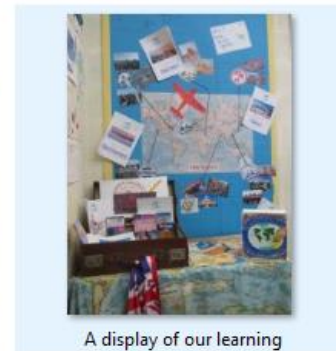
A display of our learning