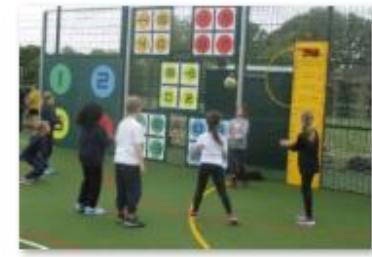
Our pok a tok interschool tournament