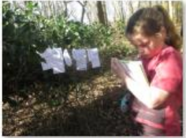
Our trip to the words