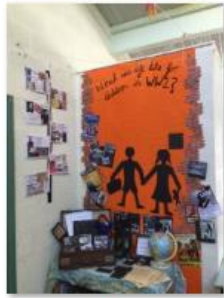
A display of our learning