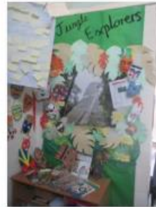
A display of our learning - Maya