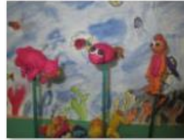
Artwork - animation