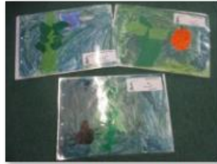
Amazing art work - colour mixing to create a front cover of our bean diaries