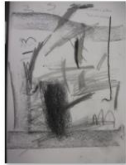
YR Exploring line and tone 2