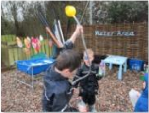
Outdoor science - working out how to get water through a hosepipe