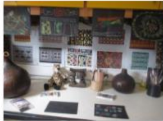
Display of our artwork - African art