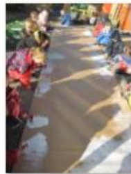
Fun creating our bakery role play area