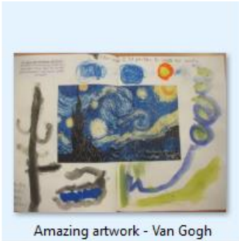
Amazing artwork - Van Gogh