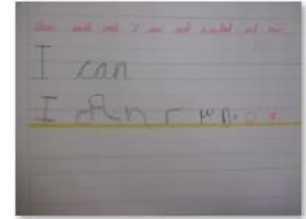
YR Writing 3