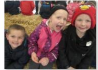
Fun at Lackham Farm