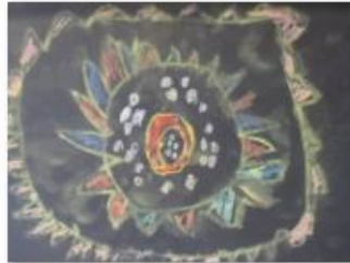
Amazing artwork - African art