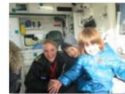
Our special visit from the paramedics