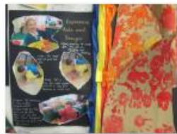
A display of our learning - colour mixing