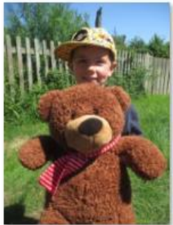
Fun enjoying Ladybirds' teddy bears and ice lollies reward time!