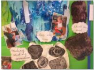
YR Bear Hunt display 1