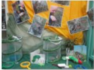
A display of our learning - from caterpillars to butterflies