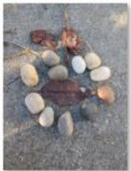
Amazing art work on portraits