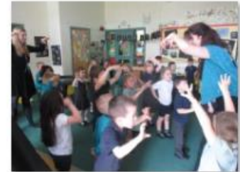
Teaching the Ladybirds an African dance