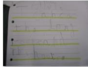
Writing outcomes - a published page from our bean diary