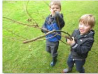
YR Forest School 5