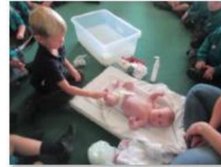
YR Visit from a special visitor