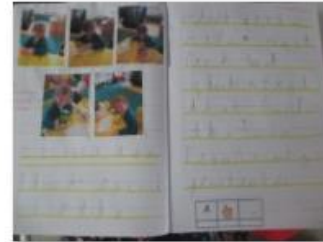
Writing outcomes - fruit salad recipe