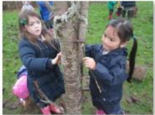
Fun making houses for the Fairies