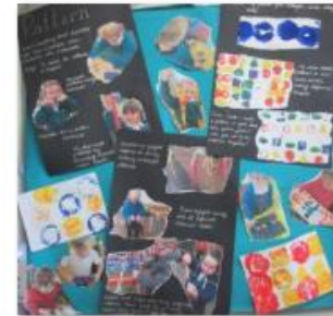
Display of artwork - exploring patterns