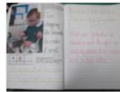
Writing outcomes about our favourite smell